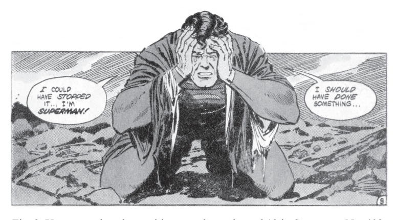
Fig. 2. Uncorrected student writing samples and panel 13 in Superman, No. 408.

Graphic novel specialist Sara J. Van Ness explains that "[f]acial expressions and body language cues contribute to the reader's understanding of a particular character's demeanor, mood, level or lack of confidence, desires, and much more," including "characters' relationships with one another in a conversation." As the writing samples and panel selection above show, the Japanese EFL students successfully decoded pictorial representations of human paralanguage , within the guiding narrative contexts of sequence,